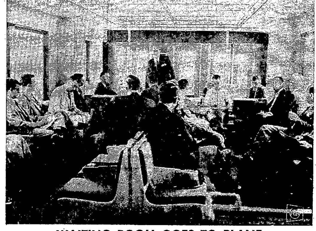
WAITING ROOM GOES TO PLANE

Newest device for passenger convenience at airports is the mobile lounge. The 38-ton bus is now in service at Washington's Dulles International Airport. It looks like a well-appointed airport waiting room, but actually it's the interior of the mobile lounge. Ninety passengers are carried to plane without ever touching ground.