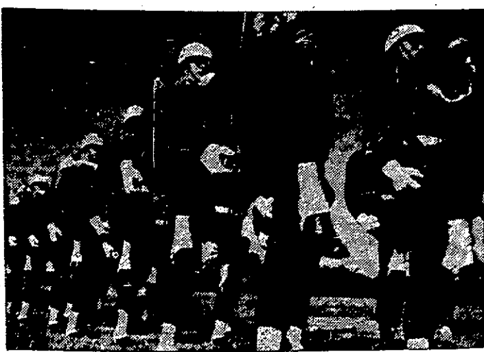
SNAPPY AGGRESSOR soldiers with crested helmets pass in review. They wear distinctive uniforms, follow a special drill manual.