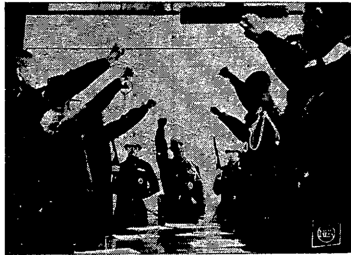
TOTALITARIAN behavior is carried through strategy meeting. Trigon troop commander and staff give salute to "The Leader."