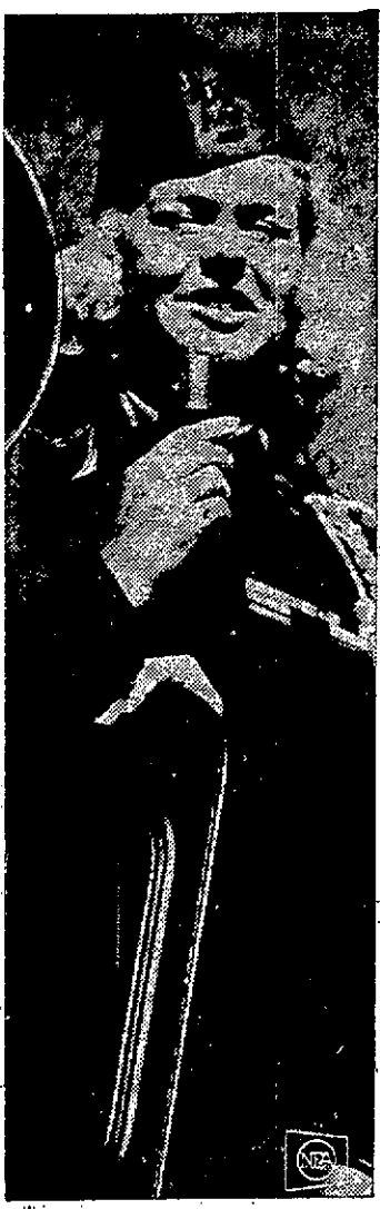
SMOOTH-TALKING "Sonia Trigon" is the Trigon's version of Axis Sally, tries to persuade American troops to surrender.

U.S. ARMY FIGHTS 'THE ENEMY WITHIN' The strangely dressed soldiers in these pictures, wearing Roman-type helmets and upside-down chevrons, aren't those of an actual country. But they regularly combat Army troops during maneuvers all over the United States. Known officially as the Aggressors, but often referred to as Trignons, these troops speak Esperanto and represent an imaginary nation ruled by the dictator of the Circle Trigon political party. The idea of using such special troops to introduce realism into training was born in 1946 at the U.S. Army Aggressor Center at Fort Riley, Kan. (where these pictures were taken). The Aggressors, or Trignons, use special identification cards and distribute propaganda, as well as "fighting" the Americans. They even carry safe-conduct passes to hand out to U.S. soldiers who may wish to surrender.