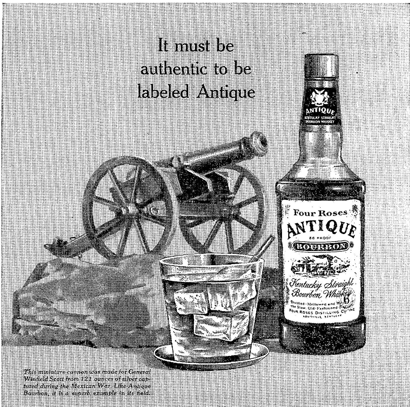
This miniature cannon was made for General Winfield Scott from 121 ounces of silver captured during the Mexican War. The Antique Bourbon, it is a superb example in its field.

It must be authentic to be labeled Antique