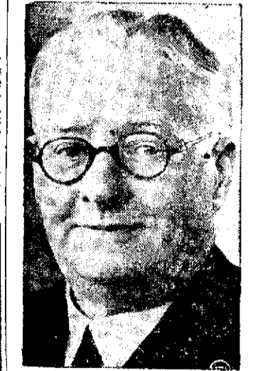
Dr. F. Townley Lord, of London, England, above, is the new president of the Baptist World Alliance. Dr. Lord, 57, was elected to head the 16,000,000-member organization at the Baptist world congress in Cleveland, Ohio.