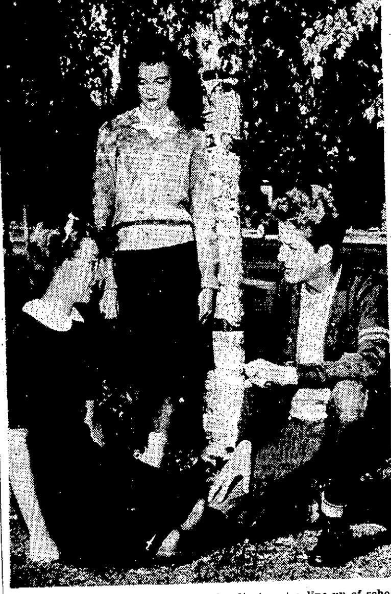
OFFICIALS... Working with the faculty to get a line-up of school activities is one of the first tasks of newly elected student body officers...