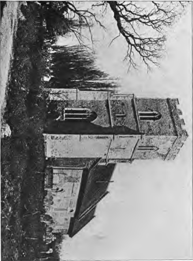
ST. MARY'S, GREAT BENTLEY.