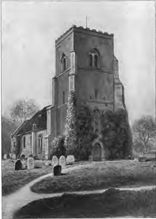
ST. MICHAEL'S, RAMSEY.