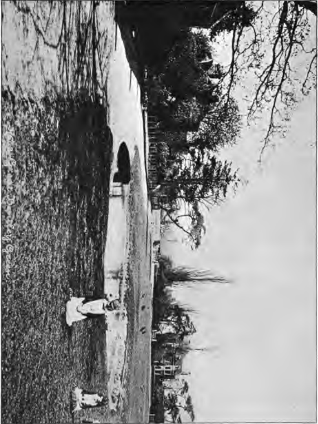
GREAT BENTLEY GREEN.