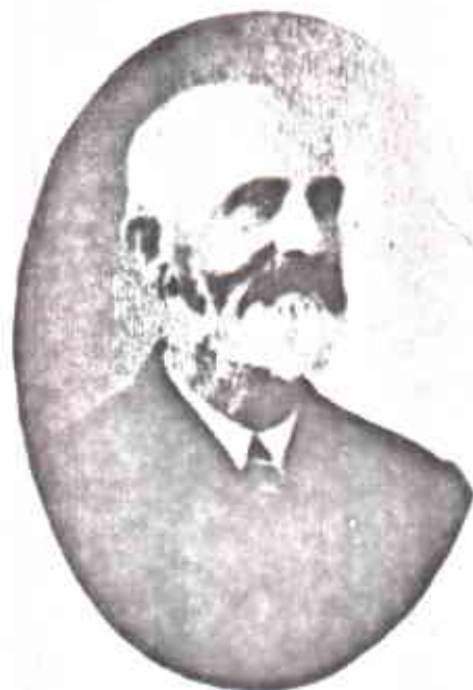
FORACE C. BELKNAP.