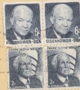
PHOTO DO NOT BEND