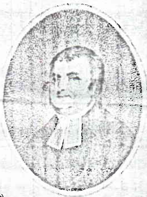
Rev. Jeremy Belknap.