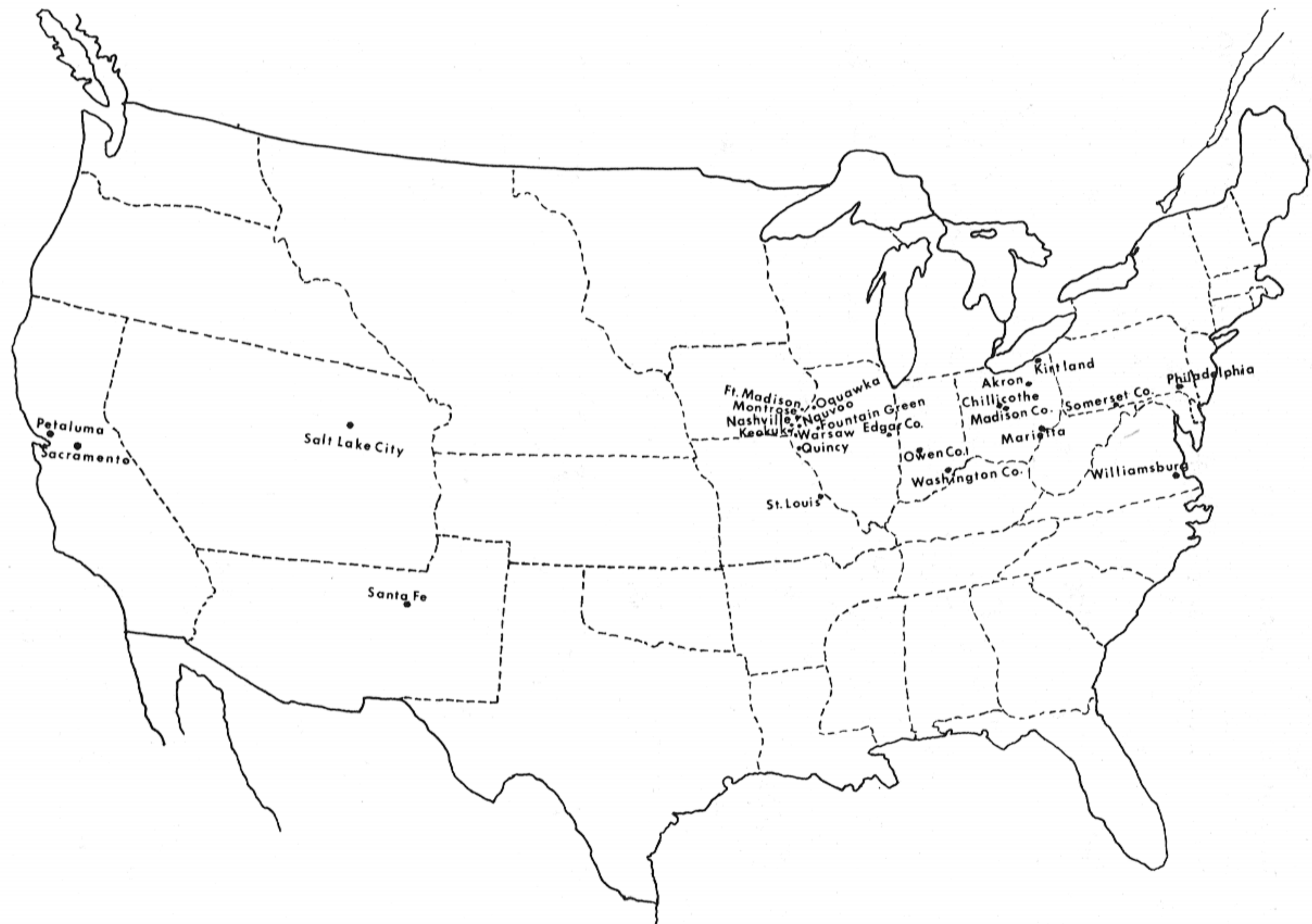
Travels of Isaac Galland.